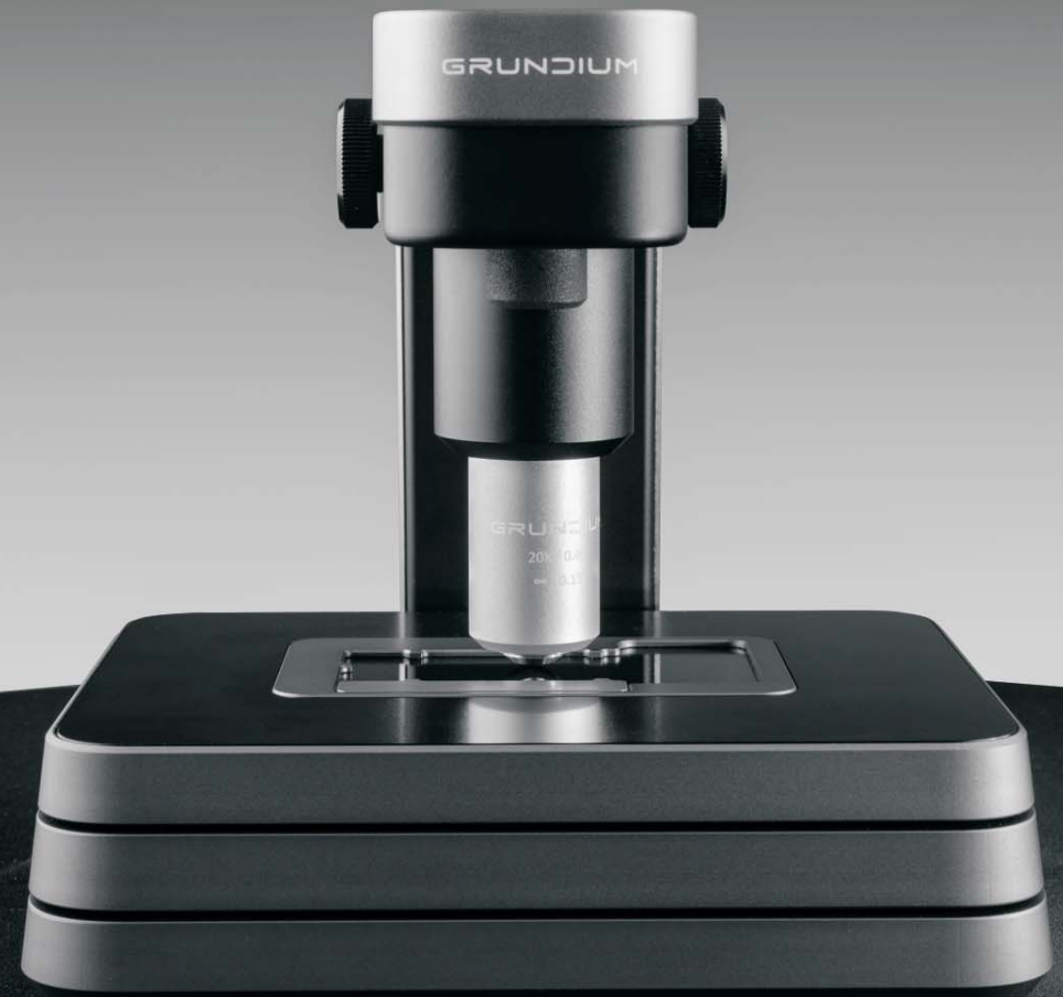
PORTABLE DIGITAL MICROSCOPE AND SLIDE SCANNER

Grundium Ocus® is CE marked according to EU 2017/746 regulation for in vitro diagnostic (IVD) medical devices. Grundium, Ocus, and its logos are trademarks of Grundium Ltd., registered in Finland and other countries. Ocus® is manufactured by Grundium Ltd., Finland.