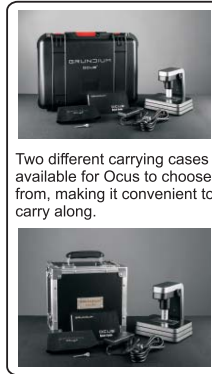
Two different carrying cases available for Ocus to choose from, making it convenient to carry along.