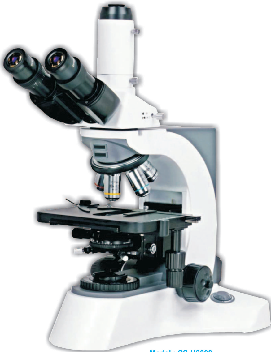
Model : CS-U8000

CatScope CS-U8000 series is an upright light-microscope with infinity-corrected optical system with, wide field of view, big operating mechanical stage and Kohler illumination. CS-U8000 is a perfect modular microscope, which can be upgraded anytime in future for different types of microscopy, viz., fluorescence, phase contrast, simple polarization, dark-field, multi-viewing, micro-photography, etc., thus making it an ideal microscope for biological applications. Surface uses special spray powder, protective, decorative, water and solvent resistant. Ergonomic design of the microscope makes the operation easy and comfortable for the user.