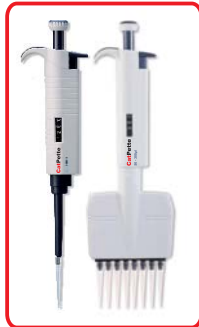
Non-Autoclavable Adjustable Pipette