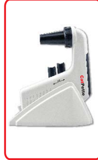
Motorized Pipette Filler