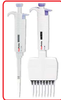
Autoclavable Adjustable Pipette